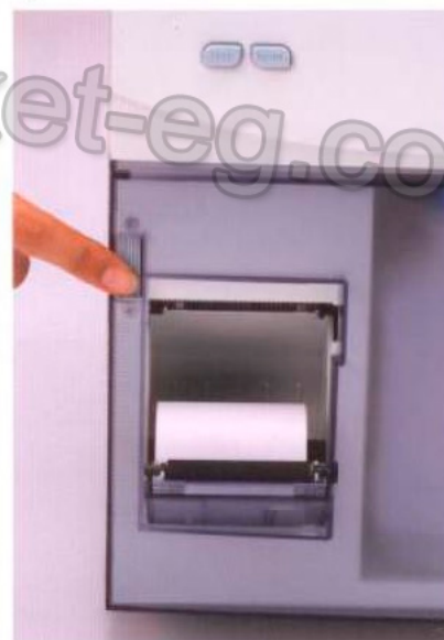
Very easy to set printing paper ワンタッチでプリント用紙をセットできます。