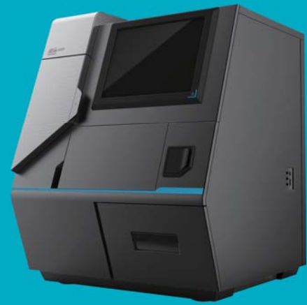
Finecare™ Full-automatic FIA Meter