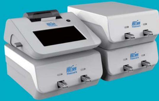
Finecare™ Multi-channel FIA Meter

High throughput, Full-automatic, Continuous, Rapid, Accurate quantitative. Click and test, only 2 steps.