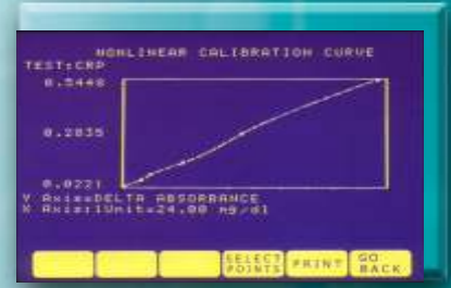
Multiple Calibration Modes