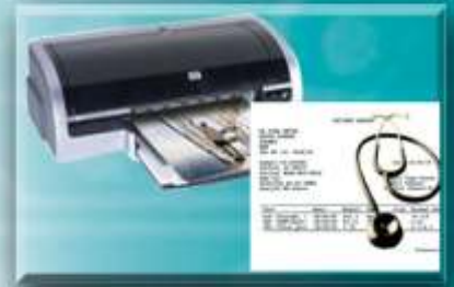
Direct Patient Result Reporting