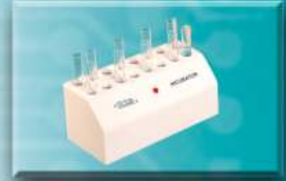
16 Position Dry Block Incubator