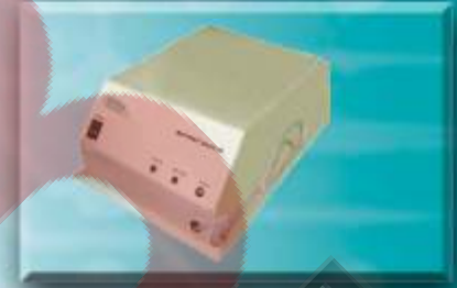
Battery Backup Unit