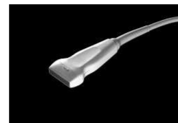
75L38EB Linear Application: Small Parts