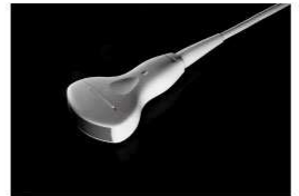
35C50EB Convex Application: Abdomen, GYN, OB, Urology