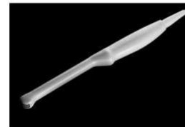
65EC10EB Endocavity Application: Endovaginal, Endorectal