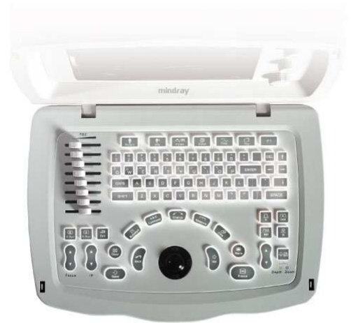
Silicon backlit control panel