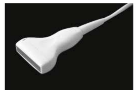
75L60EA Linear Application: Orthopedics, Breast, Musculoskeletal