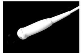
65C15EA Micro-convex Application: Pediatrics