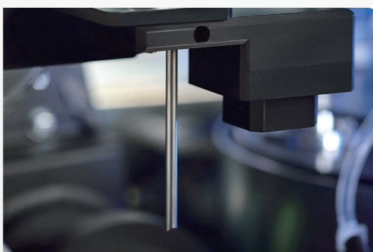
Solid-liquid waste separation Environmental friendly