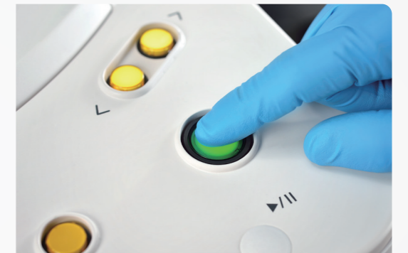
One-key start Extremely easy to use