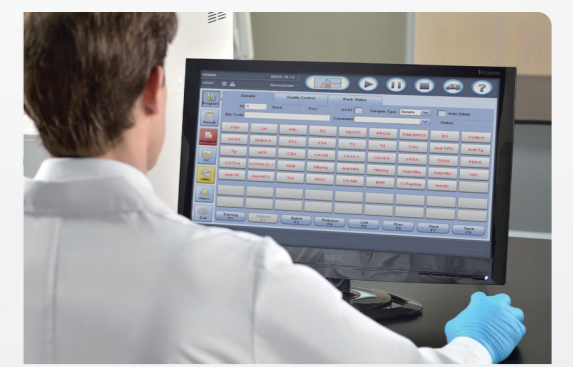
Intuitive software interface Easy access to all functions