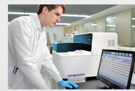
User maintenance free Lighten the workload