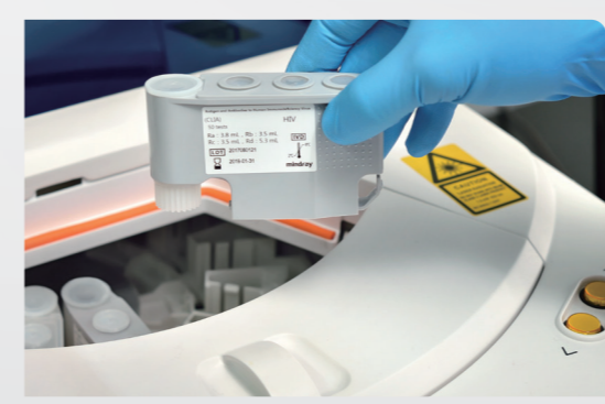
Continuously loading of reagents and consumables