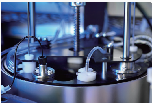
Precise magnetic separation with consistent performance reliability